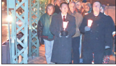
Supporters make their way across the bridge into New Hope during the candlelight vigil and walk.

A candlelight vigil and blessing, held in honor of friends and family who have passed away from AIDS, took place Dec. 1 in the parking lot of Lambertville Station in Lambertville, N.J.