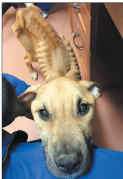
Butterscotch on his first day at the shelter.

On Jan. 6, Animal Alliance was called upon for the emergency rescue of Butterscotch, an emaciated, 10-month old hound, shepherd and pitbull mix. Butterscotch was impounded as a stray by Liberty Humane Society in Jersey City, a high-volume shelter.